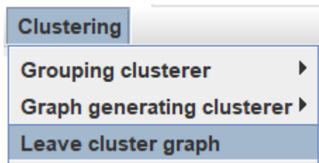
Figure 37. The menu system after changing to cluster graph

All the now mentioned constraints will be changed back, and the original module graph will be seen in case you choose the Leave cluster graph entry (see Figure 37).